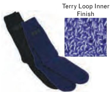
Terry Loop Inner Finish