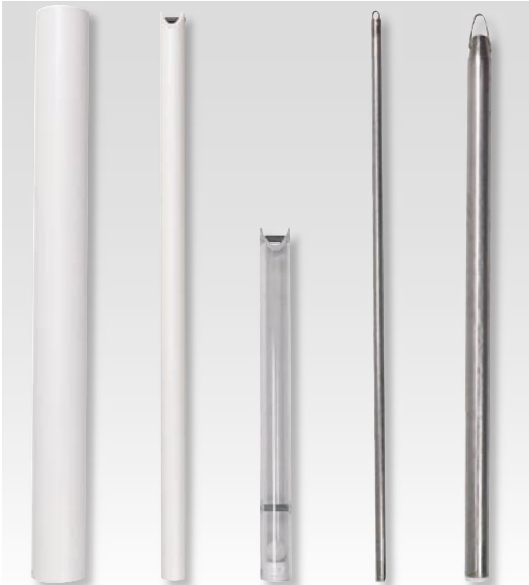
3.5" Dia. PVC

570005